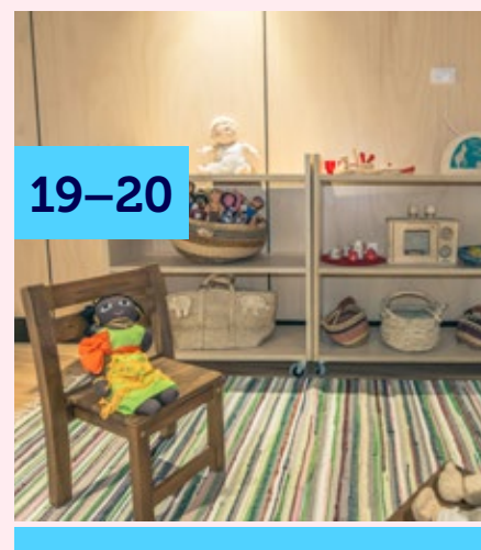
RMIT University Conditions of child care