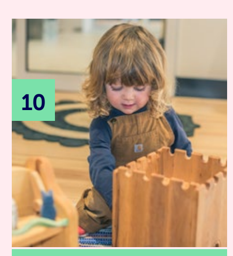
Program - how children learn