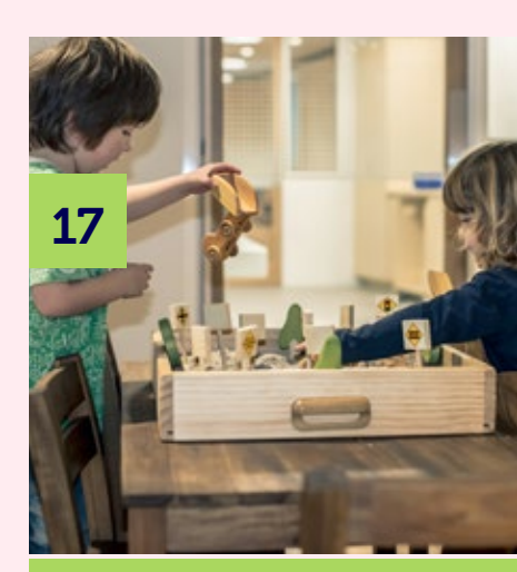
Positive guidance and behaviour policy