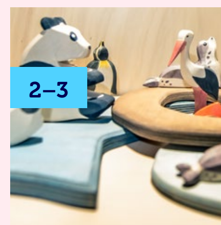
Privacy policy statement