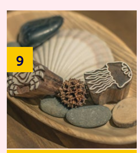
Orientation and the settling in process