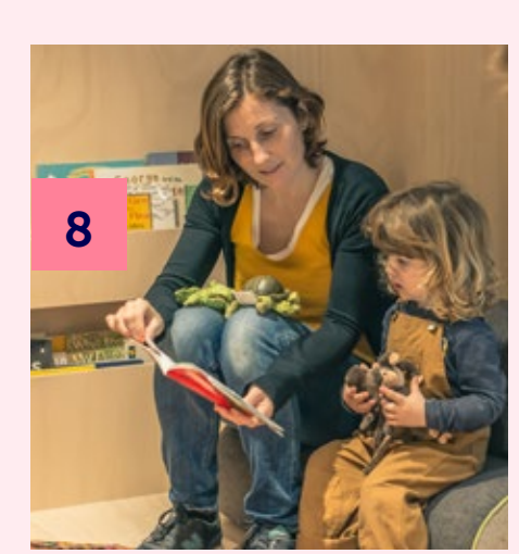
Enrolling your child at the centre